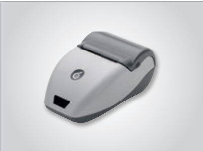
Sprint Print out cycle protocols on thermal paper with 10-year paper warranty.