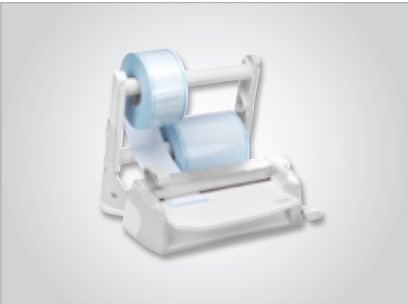
Seal² and SealVal² The W&H sealer creates a 12 mm wide seal in just two seconds with no risk of burning the sterilization package. The absolutely hermetic and strong protection of the sterile goods from environmental influences guarantees continuing sterility.