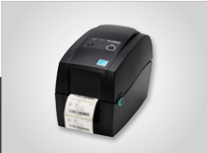
Barcode label printer The label printer can be connected to the sterilizer to print barcodes. In combination with the integrated data logger, it improves your traceability system. The label printer is a quick and easy tool to link the sterilization cycle with patient files.