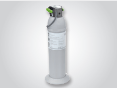
Multidem Multidem supplies demineralized water for steam generation and can be used for many conventional sterilizers and other daily activities such as instrument rinsing. As a result, it ensures consistent and optimised performance, thereby extending the service life of your sterilizer.