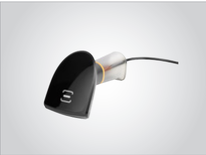
Barcode scanner This enables you to scan labels into patient files.