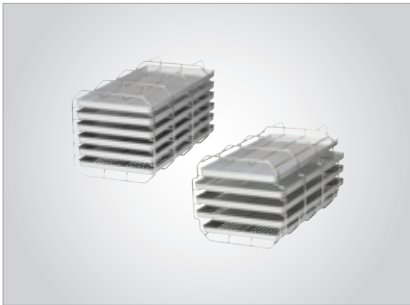
Reversible rack The best rack for your load: for 3 large and 2 standard trays or 3 cassettes for 6 trays or 3 cassettes

W&H offers a wide range of accessories to optimise your workflow. Minor extras lead to major results. Work in the practice is easier and your team saves time.