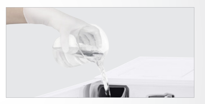
Easy filling An integrated high-capacity funnel prevents water splashes during the filling process.

The intelligent menu structure of the new Lara XL sterilizer ensures extraordinarily high operating comfort: You can navigate to the different functions quickly and intuitively using the large colour touch display.